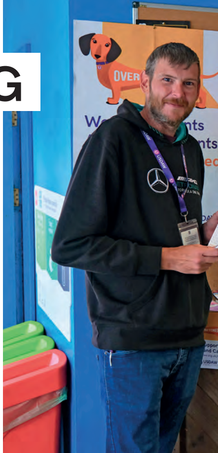
Co-op Lea Green Distribution, St Helens

Tesco Livingston We had very positive interactions with our members about Spotlight Day and all the help that is available from the union. We had lots of members filling out the Overstretched survey.