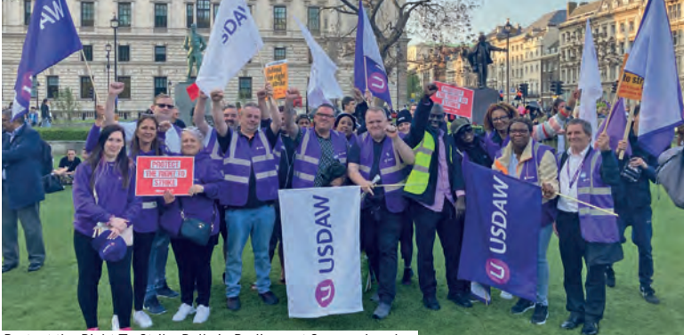
Protect the Right To Strike Rally in Parliament Square, Londor