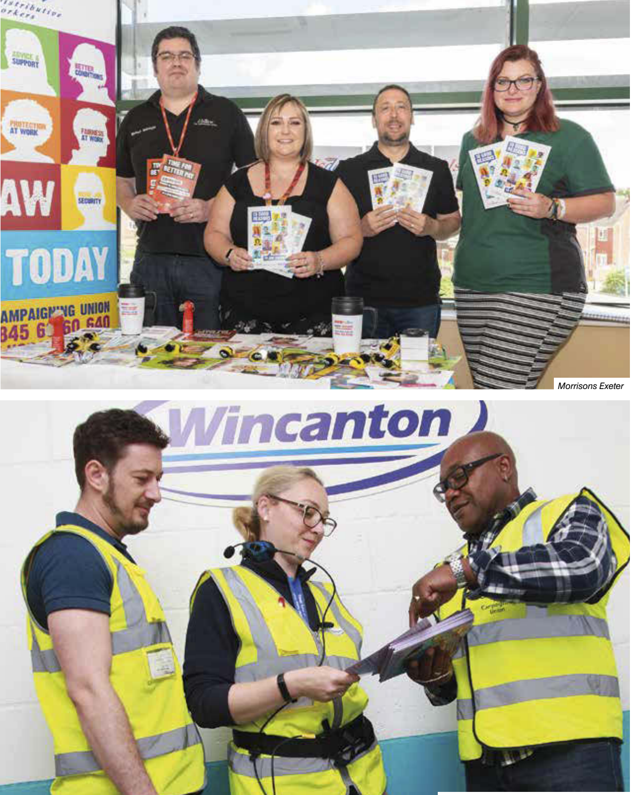
Wincanton Co-op Distribution, Wellingborough