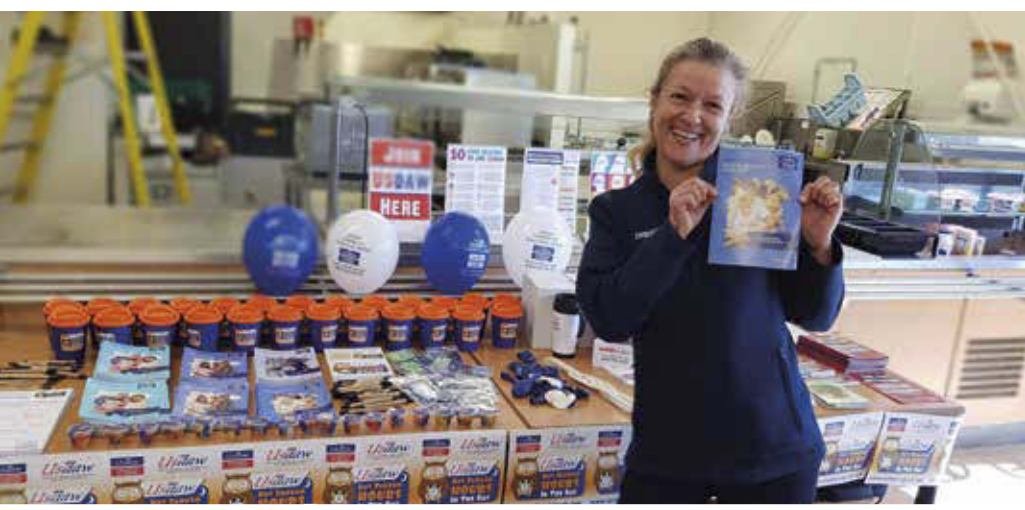
Pictured L-R: Southern division's Recruitment and Organising Team award winners from Tesco Extra Ryde, Isle of Wight, Tesco Skegness get ready for Parents and Carers Spotlight Day.