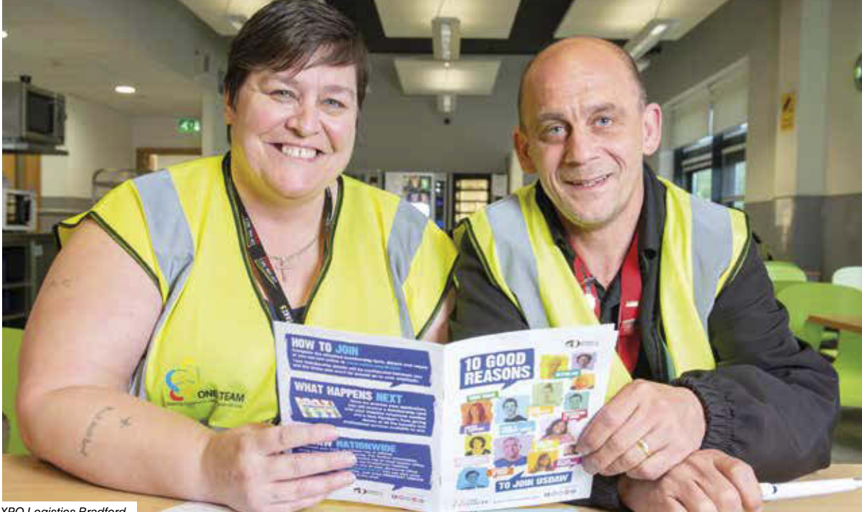
XPO Logistics Bradford