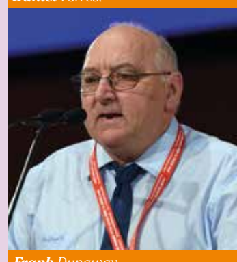
Network May/June 2016 19