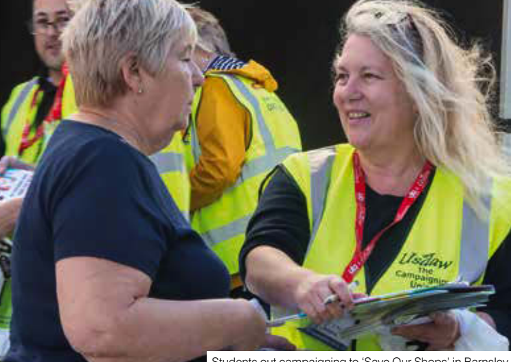
Students out campaigning to 'Save Our Shops' in Barnsley

"Being away from home for a week was hard to begin with but everyone there was friendly and a lot of fun to be around, I think I have definitely made friends for life! The fact that it was a residential course helped us all to interact with each other and have new experiences. The location helped too as there wasn't much phone signal so social interaction was key and it helped everyone to get to know each other. The night classes were very good too and doing a large street campaign for Save Our Shops in Barnsley was amazing to see and be a part of!"