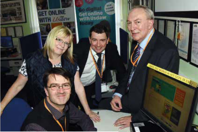
The union is encouraging members to get online this October