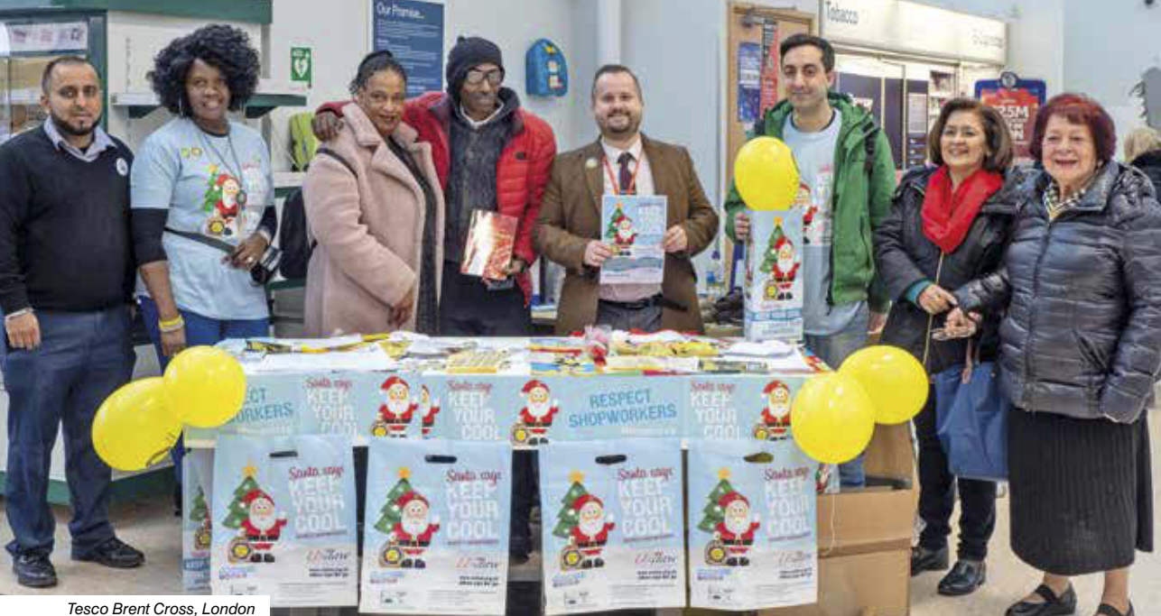
Tesco Brent Cross, London