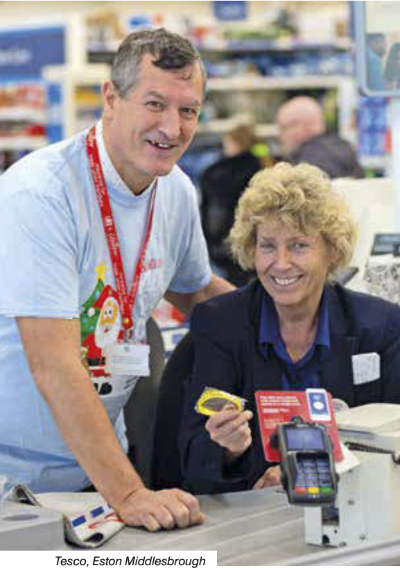
Tesco, Eston Middlesbrough