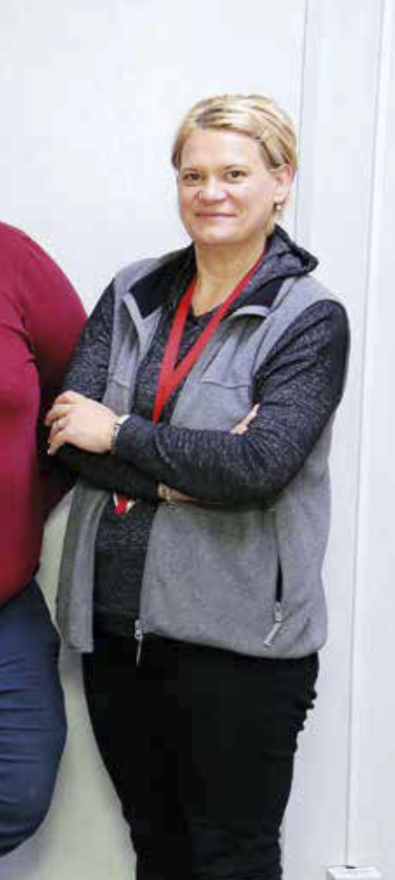
Usdaw reps at the RS Components site in Corby

achievement considering Corby is an industrial site."