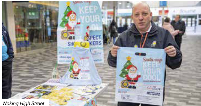
Woking High Street