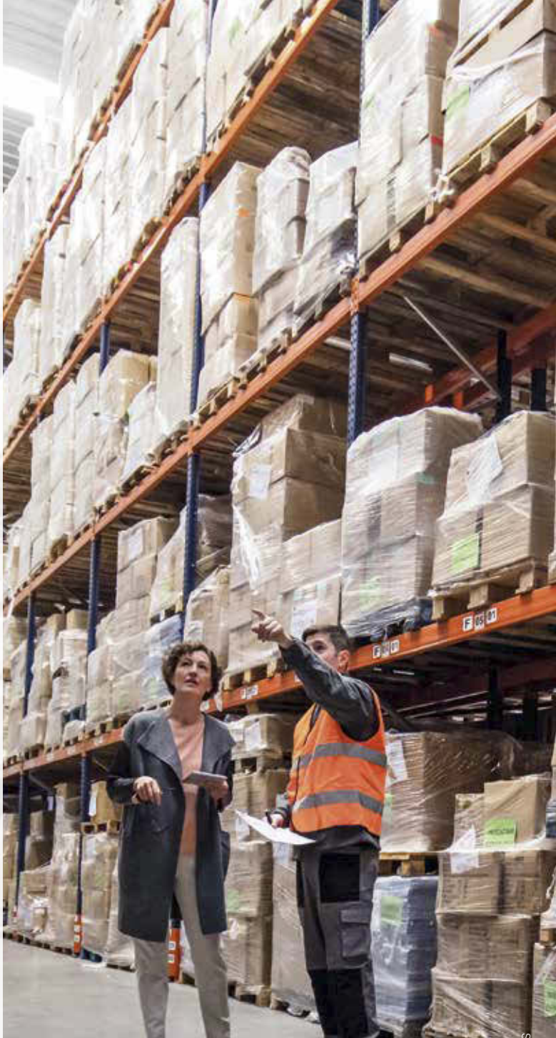
Stock Photography. Posed by models.

To read more about successful recruitment and organising visit www.usdaw.org.uk/reps/organising-recruitment