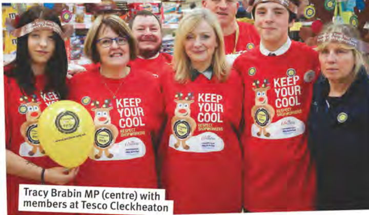
Tracy Brabin MP (centre) with members at Tesco Cleckheaton

Tracy donned the campaign t-shirt with the Keep Your Cool slogan and chatted to staff about the issues they face.