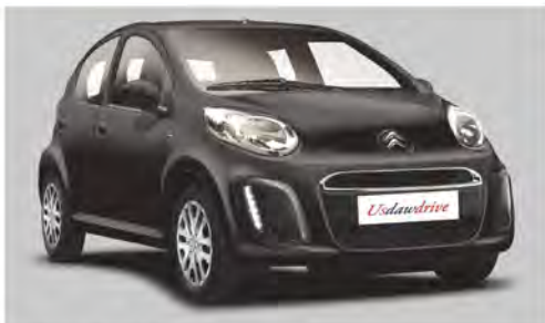
59 REG CITROEN C1 1.4 HDi VTR 5DR BLACK 41K