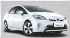
62 REG TOYOTA PRIUS 1.8 VVTi SPIRIT AUTO WHITE 90K