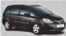
13 REG VAUXHALL ZAFIRA 1.7 CDTi EXCLUSIV BLACK 51K