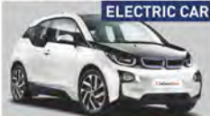
14 REG BMW I3 RANGE 5DR EXTENDER AUTO WHITE 32K