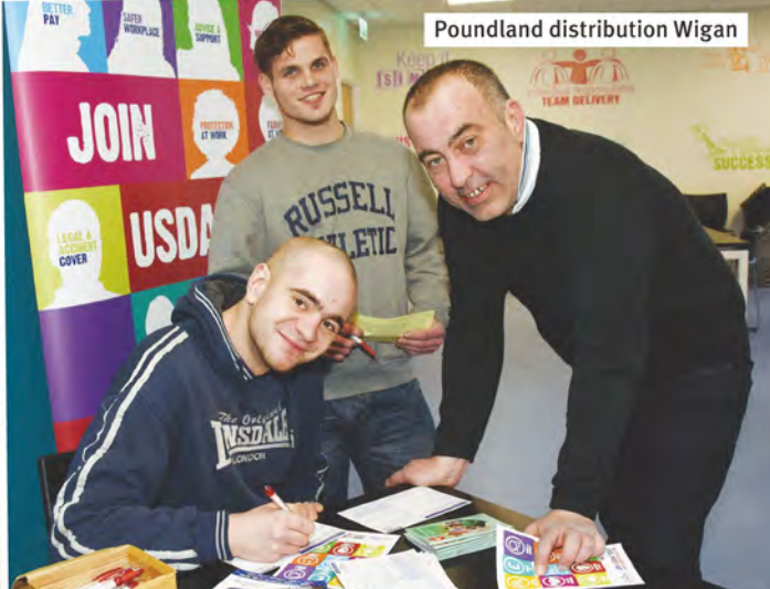
Poundland distribution Wigan