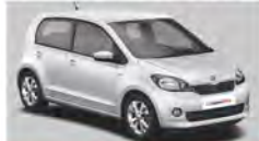
63 REG SKODA CITIGO 1.0 MPI SE 5DR SILVER 52K