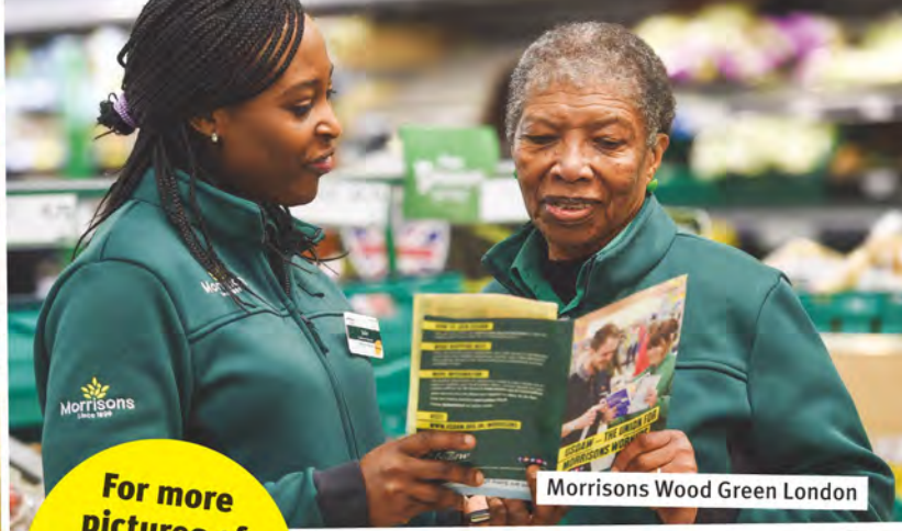
Morrisons Wood Green London

For more pictures of activists in action: usdaw.org.uk