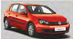
10 REG VW GOLF 1.6 TDI 105 BLUEMOTION SE 5DR RED 75K