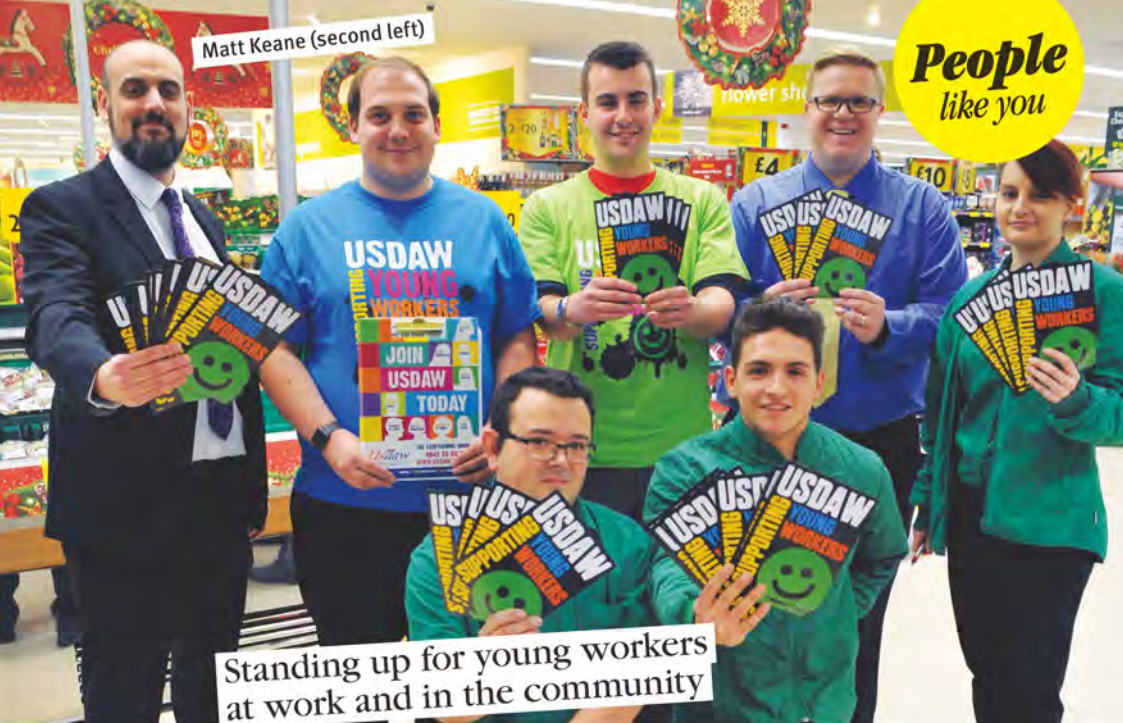
Standing up for young workers at work and in the community