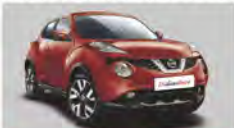
62 REG NISSAN JUKE 1.5 DCi VISIA 5DR DARK RED 71K