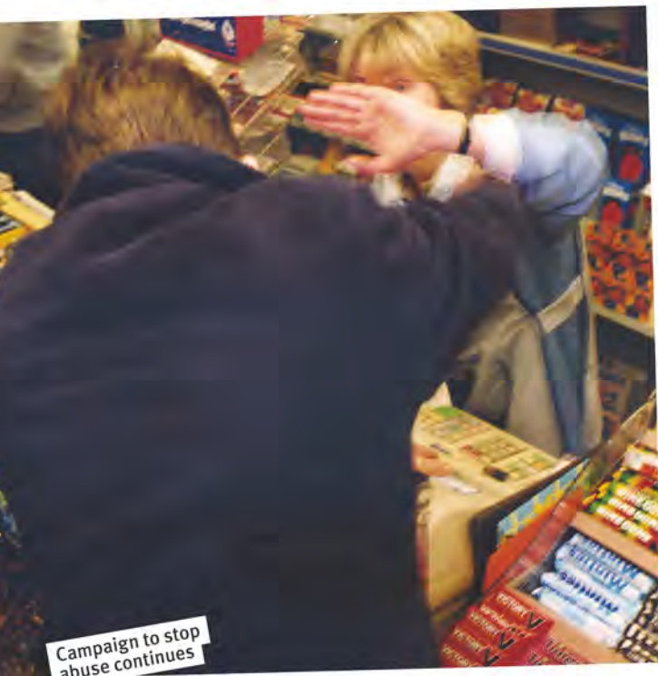
Campaign to stop abuse continues

Worrying rise in crime figures vindicates Usdaw's Freedom From Fear drive