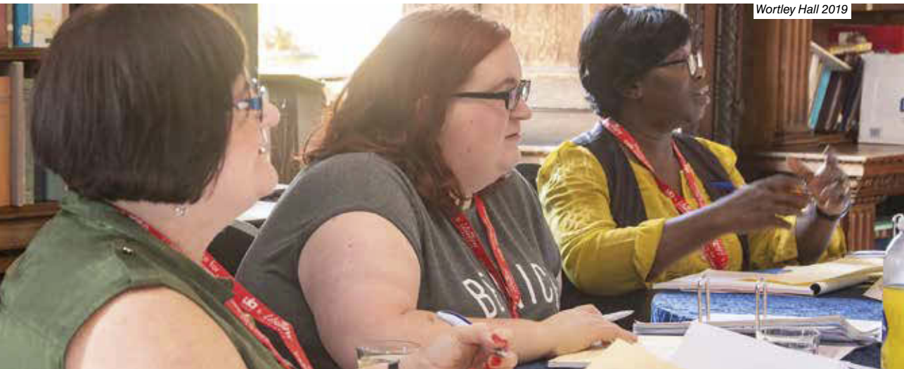
Wortley Hall 2019