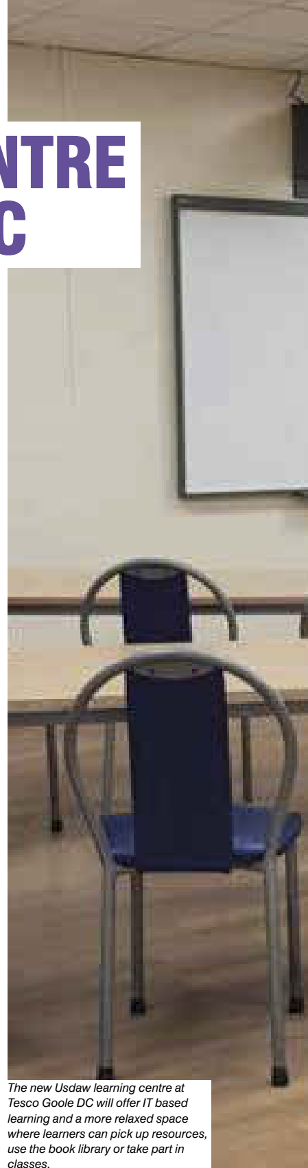
The new Usdaw learning centre at Tesco Goole DC will offer IT based learning and a more relaxed space where learners can pick up resources, use the book library or take part in classes.

Tesco managers throughout the DC are also enthused by the new learning suite, the site has always been supportive of the whole lifelong learning project and recently they featured the Usdaw learning offer and centre as part of the site's promotional recruitment video, demonstrating the importance of the learning agenda as a key benefit of working at the site.