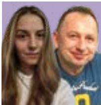
2 Sisters Thetford Rep Team 2022 Winners

This award seeks to honour a team of Usdaw Reps and Shop Stewards who have pulled together as a team to build an effective collective voice in their workplace using the Shop Steward structures.