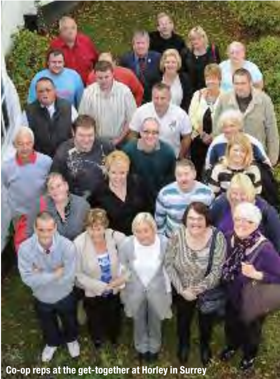
Co-op reps at the get-together at Horley in Surrey

Hundreds of reps made the effort to attend reps' get-togethers where activists can learn from each other, share ideas and get the latest updates from officials