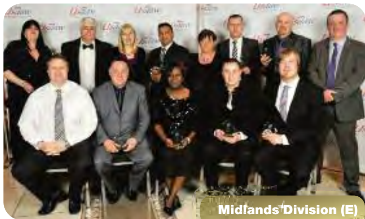
Midlands Division (E)