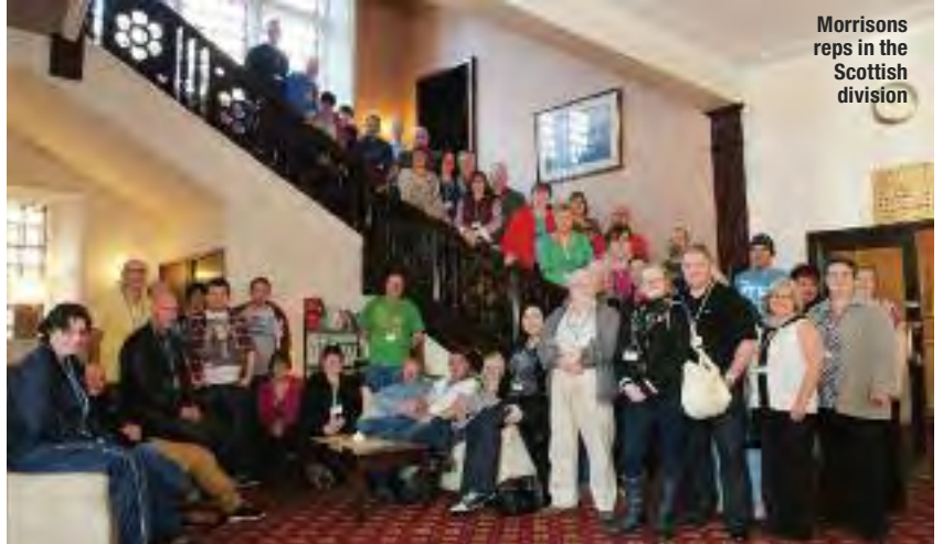
Morrisons reps in the Scottish division