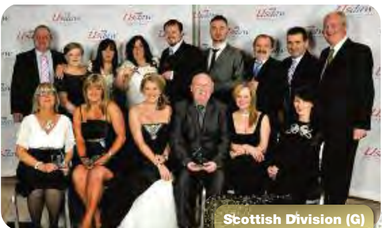
Scottish Division (G)