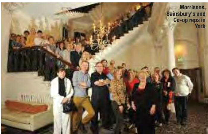
Morrisons, Sainsbury's and Co-op reps in York