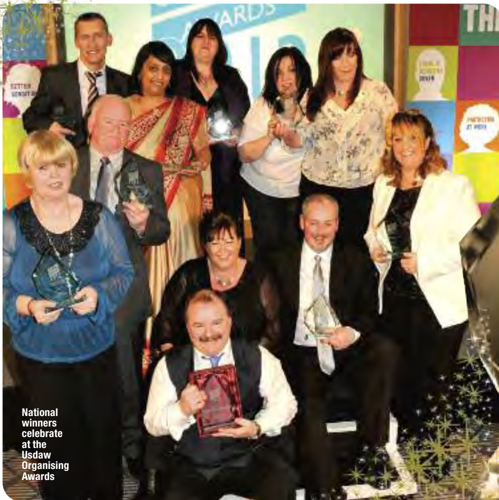
National winners celebrate at the Usdaw Organising Awards

TUC general secretary Frances O'Grady made a point of speaking up for the families of reps. "We need to acknowledge the role played by husbands, wives, partners and the families of reps who give us their vital support and keep us going," she said. "Unions generally don't do enough to celebrate the contribution of their reps and families but tonight does just that. Who needs the Oscars when you've got nights like these? Usdaw is a modern campaigning union and a union that wins."