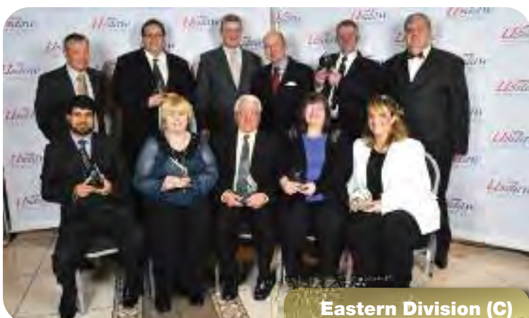
Eastern Division (C)