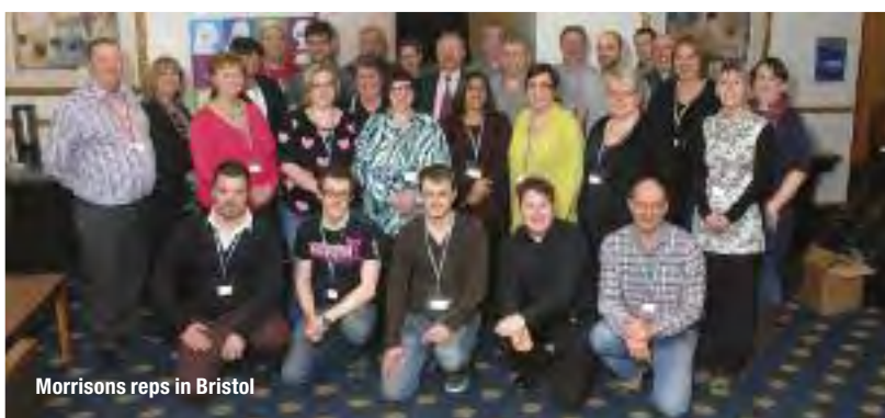
Morrisons reps in Bristol