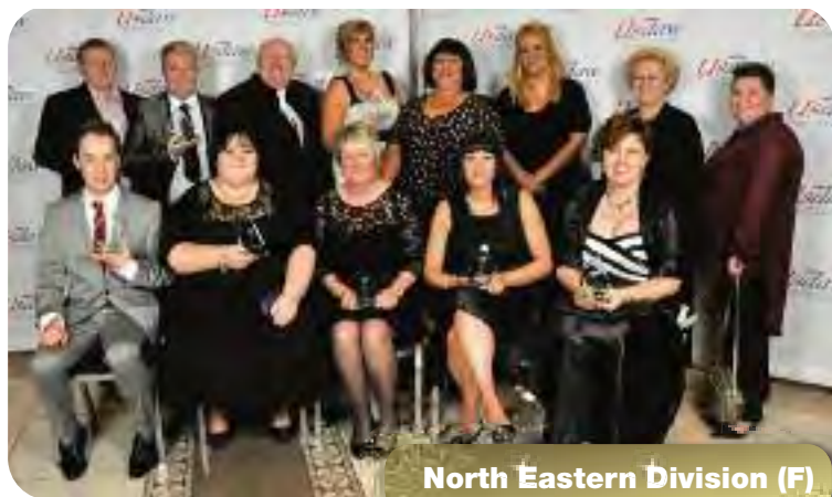
North Eastern Division (F)