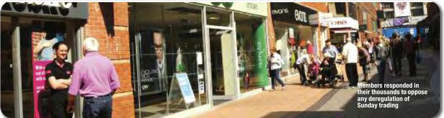
Members responded in their thousands to oppose any deregulation of Sunday trading

Contact the politics section on: political.section@usdaw.org.uk 0161 224 2804 or visit: www.usdaw.org.uk/ourcampaigns/usdawforlabour