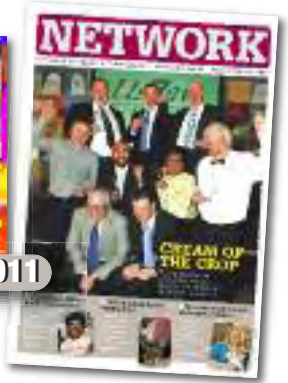
The union's main printed communication with members has evolved from a newspaper in 1991 to two glossy colour magazines in 2011