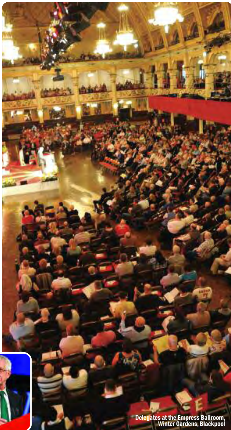
Delegates at the Empress Ballroom, Winter Gardens, Blackpool