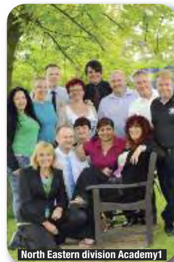
North Eastern division Academy1