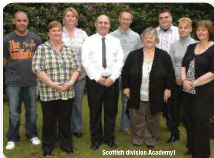
Scottish division Academy1

"I just want to be involved in as much as possible in the future and grasp every opportunity the union has to offer me."