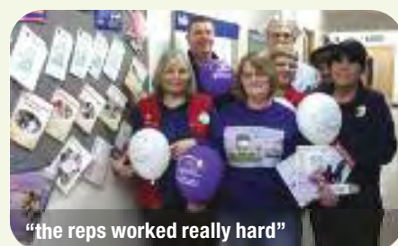
"the reps worked really hard"