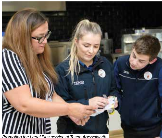
Promoting the Legal Plus service at Tesco Aberystwyth