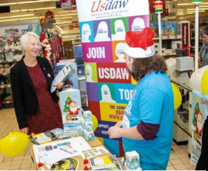
Sainsbury's Colchester Avenue, Cardiff with Welsh assembly member Jenny Rathbone