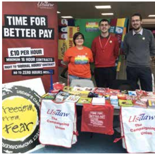
Pictured L-R: Recruiting at Argos Purley Way in Croydon; Health and safety inspection at Tesco in North Shields, North East; Scottish young workers' committee at a stall at Stirling University.