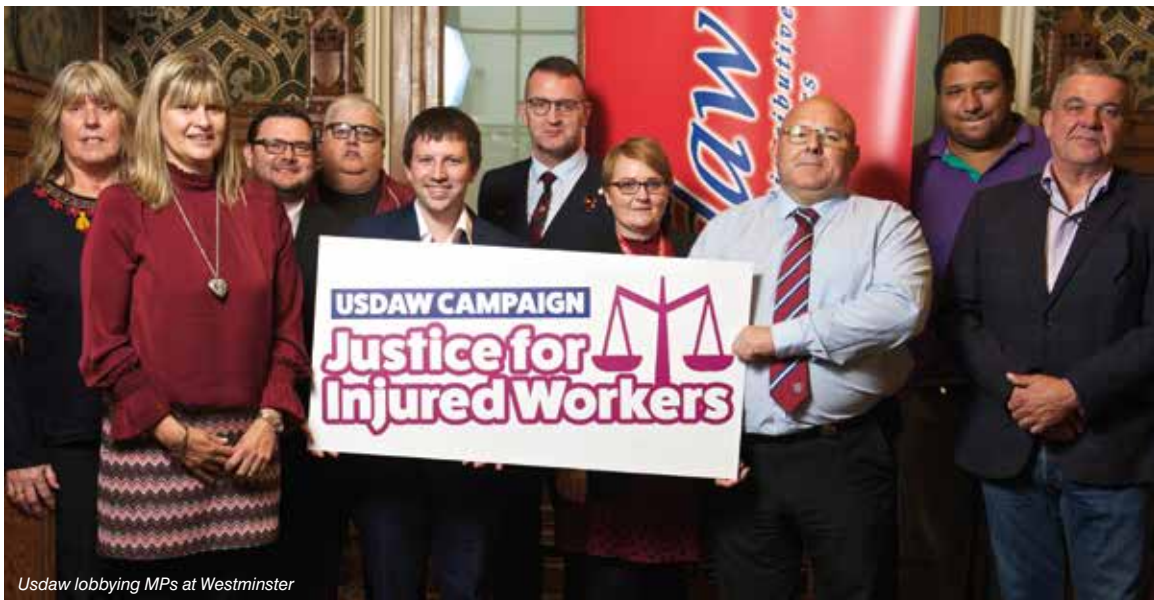
Usdaw lobbying MPs at Westminster