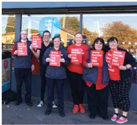
Pictured L-R: Studying English at Tesco CFC in Croydon; Talking about mental health at Tesco Thurso in Scotland; and Tesco Yorkgate in Leeds; Showing Racism the Red Card at Lawrence Weston Co-op Bristol.