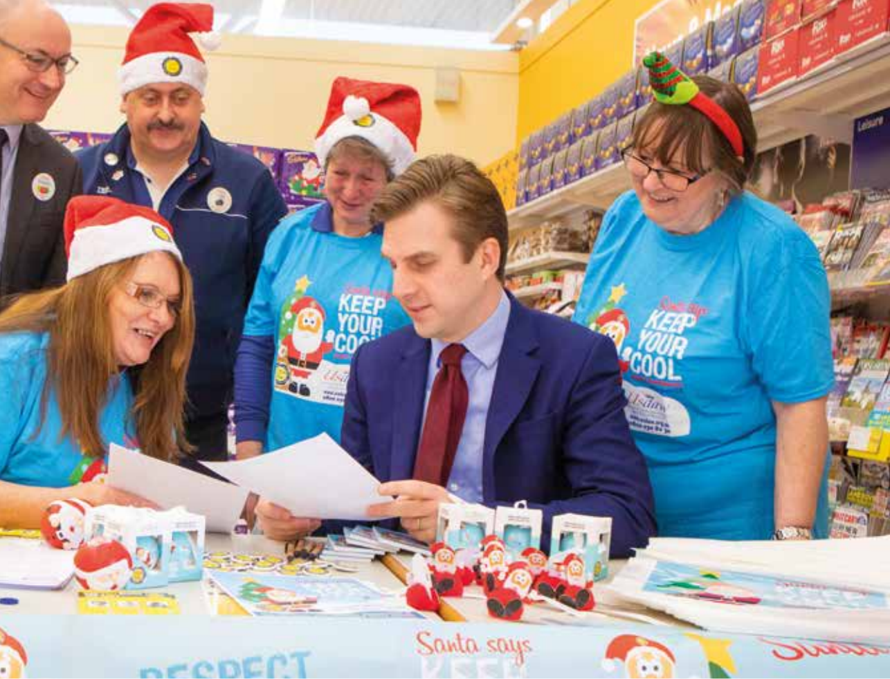
Sainsbury's Heaton Park, Manchester