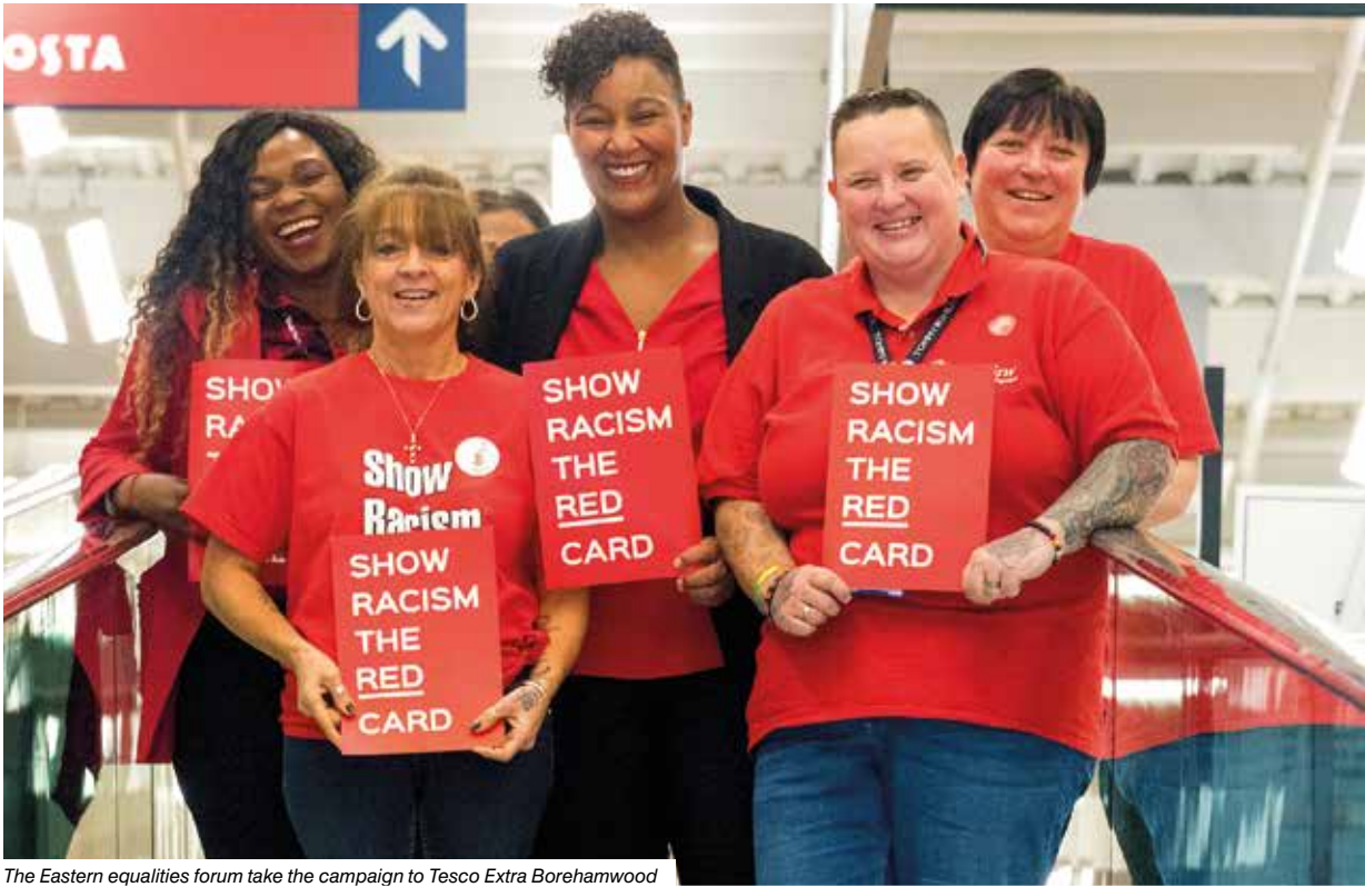
The Eastern equalities forum take the campaign to Tesco Extra Borehamwood