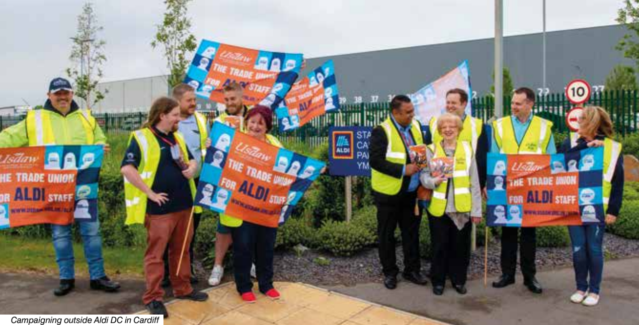
Campaigning outside Aldi DC in Cardiff