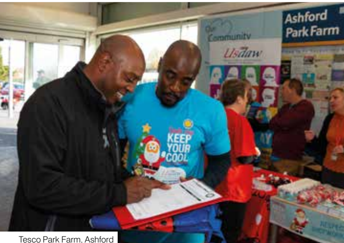
Tesco Park Farm, Ashford