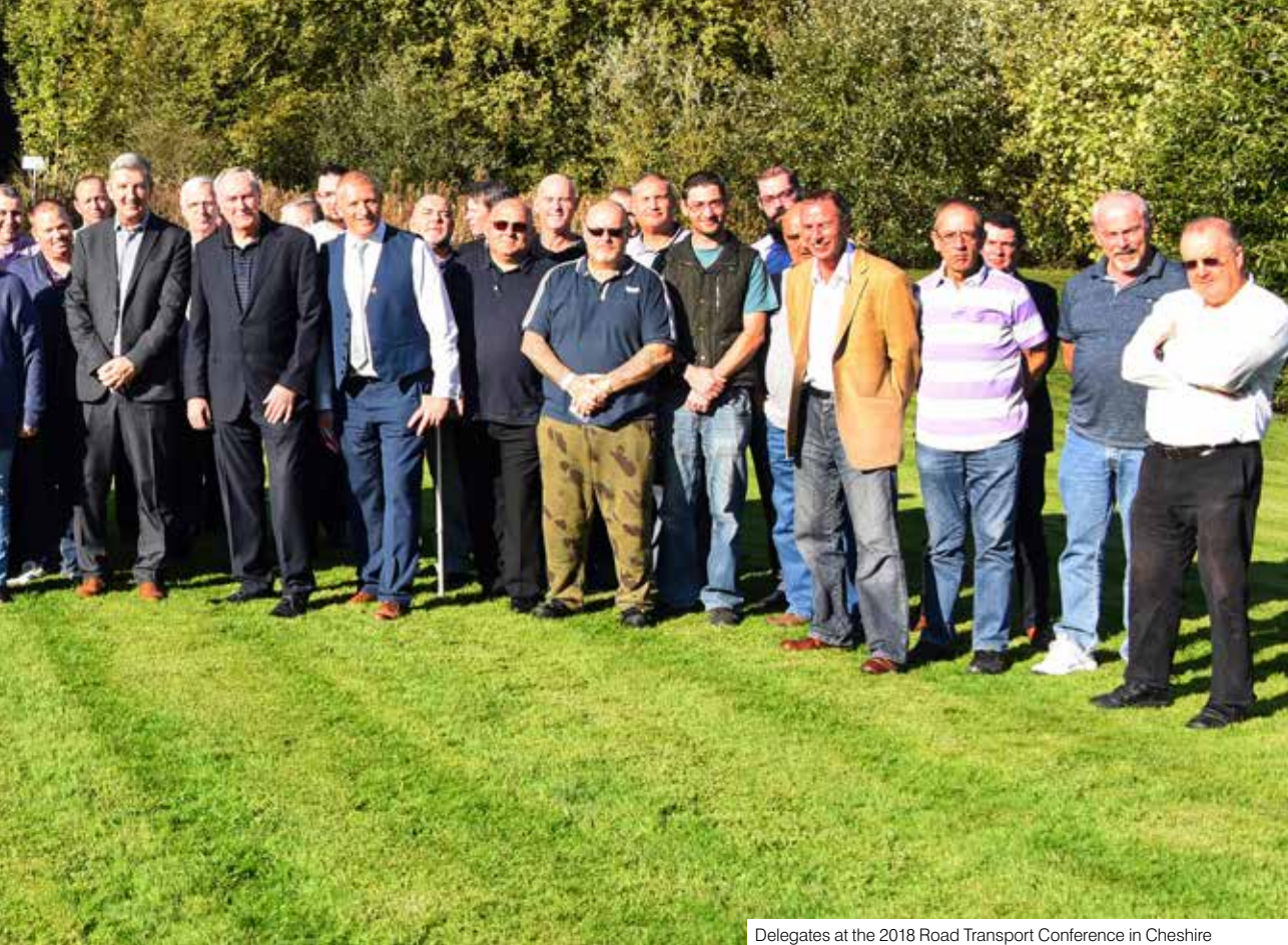
Delegates at the 2018 Road Transport Conference in Cheshire

of the sector that offer us a real opportunity to grow.