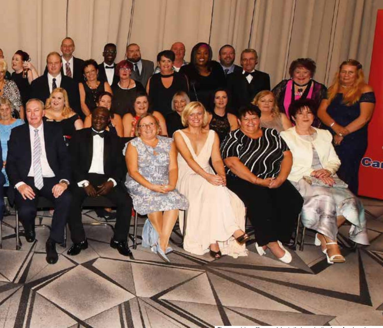
The organising officers celebrate their graduation from Academy1