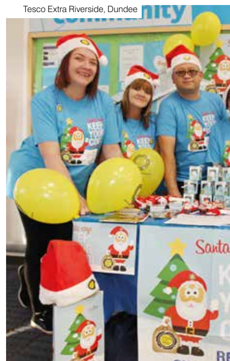
Tesco Extra Riverside, Dundee