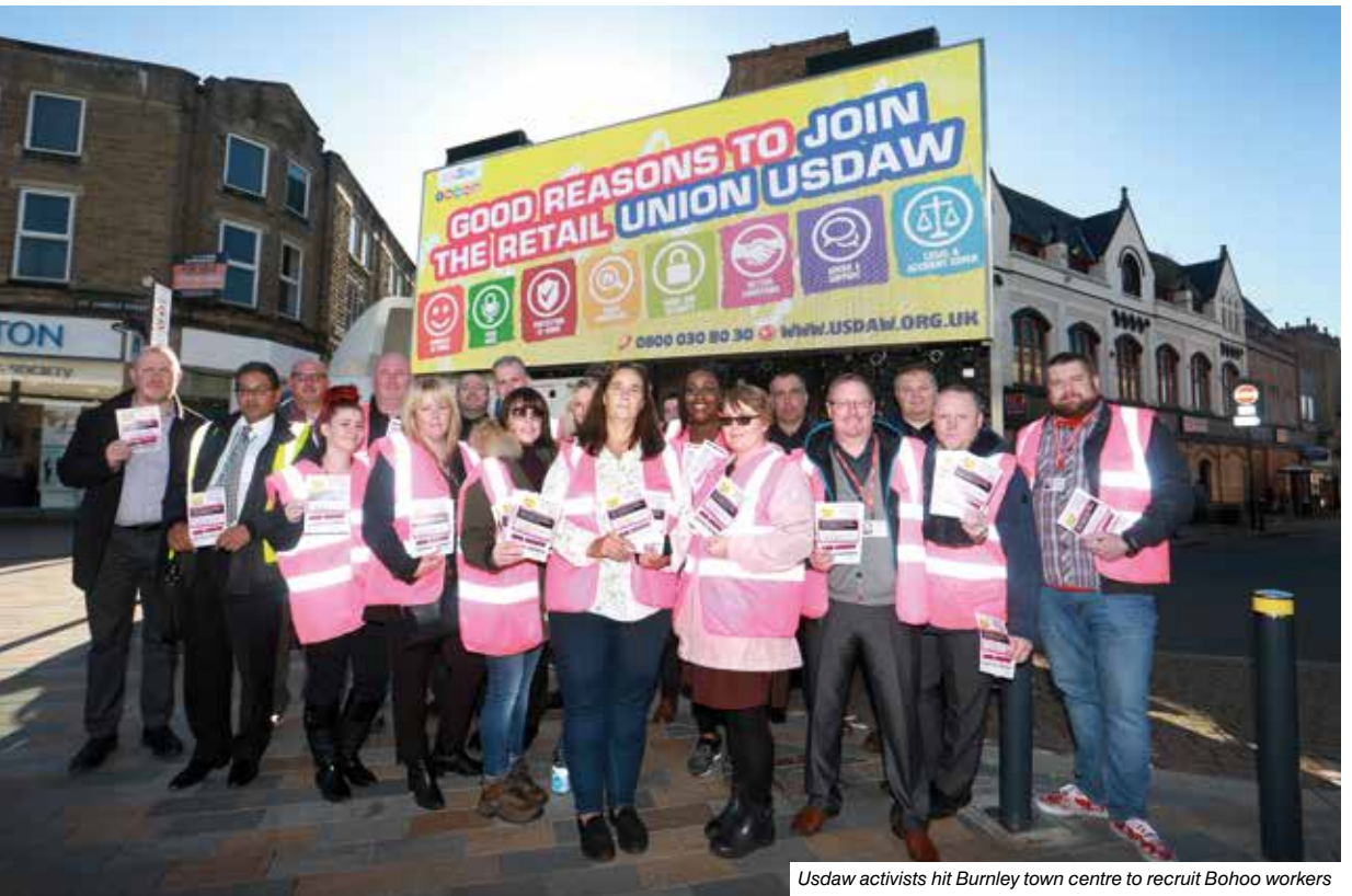
Usdaw activists hit Burnley town centre to recruit Bohoo workers