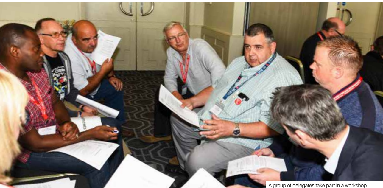
A group of delegates take part in a workshop

BEING A DRIVER, YOU DON'T GET THE CHANCE TO HAVE MUCH TIME ON-SITE, SO STAND-DOWN AND ACADEMY REPS HAVE BEEN INVALUABLE