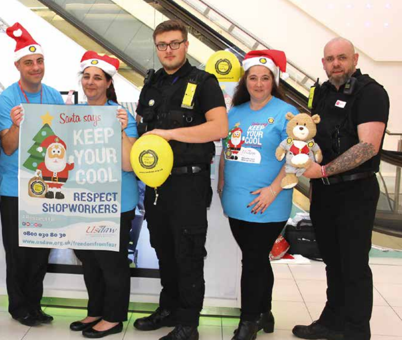
Tesco Holywell with David Hanson MP