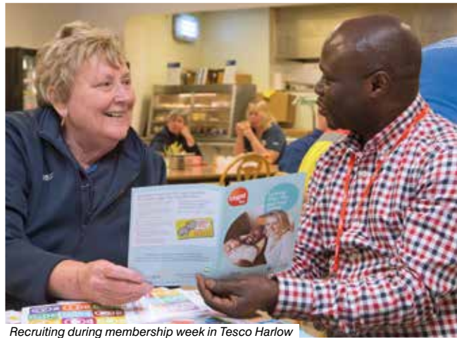
Recruiting during membership week in Tesco Harlow