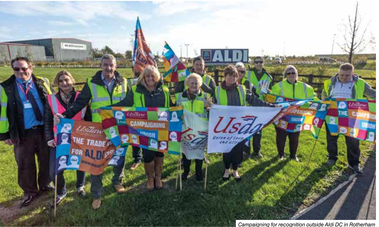
Campaigning for recognition outside Aldi DC in Rotherham