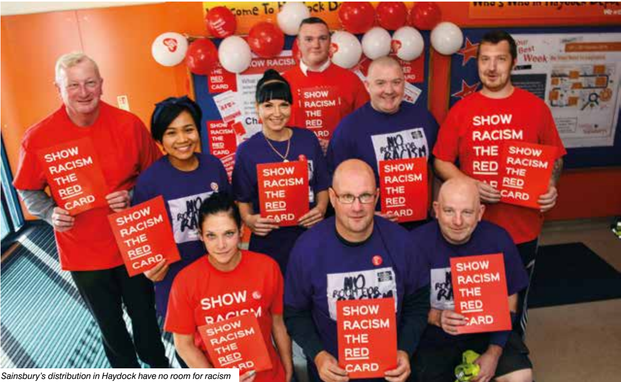
Sainsbury's distribution in Haydock have no room for racism