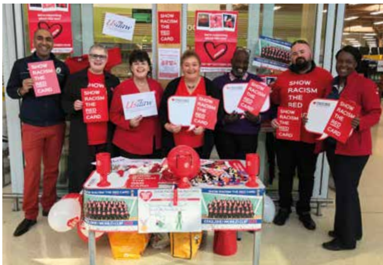
Pictured left The Midlands divisional equalities forum take Wear Red Day to West Bromwich Tesco.