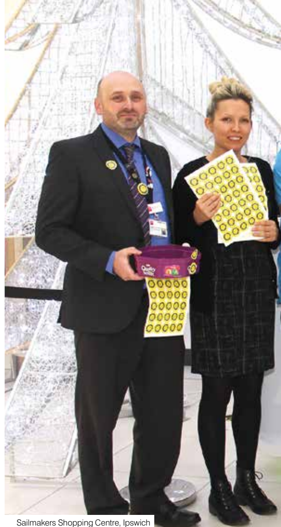
Sailmakers Shopping Centre, Ipswich