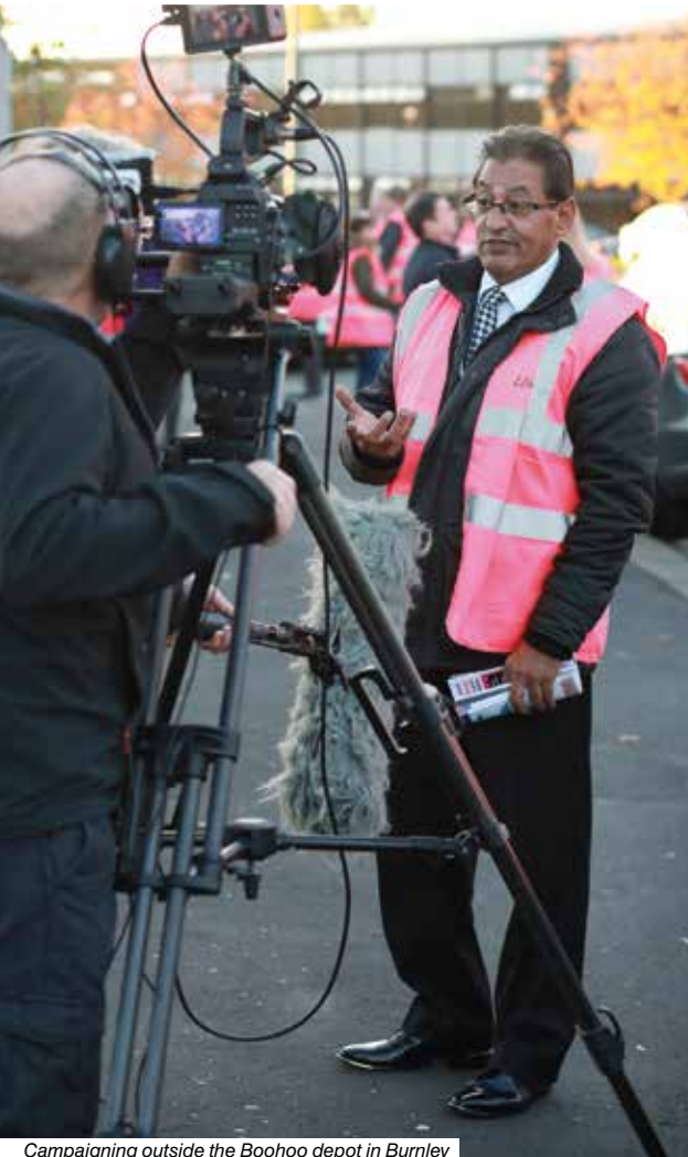
Campaigning outside the Boohoo depot in Burnley